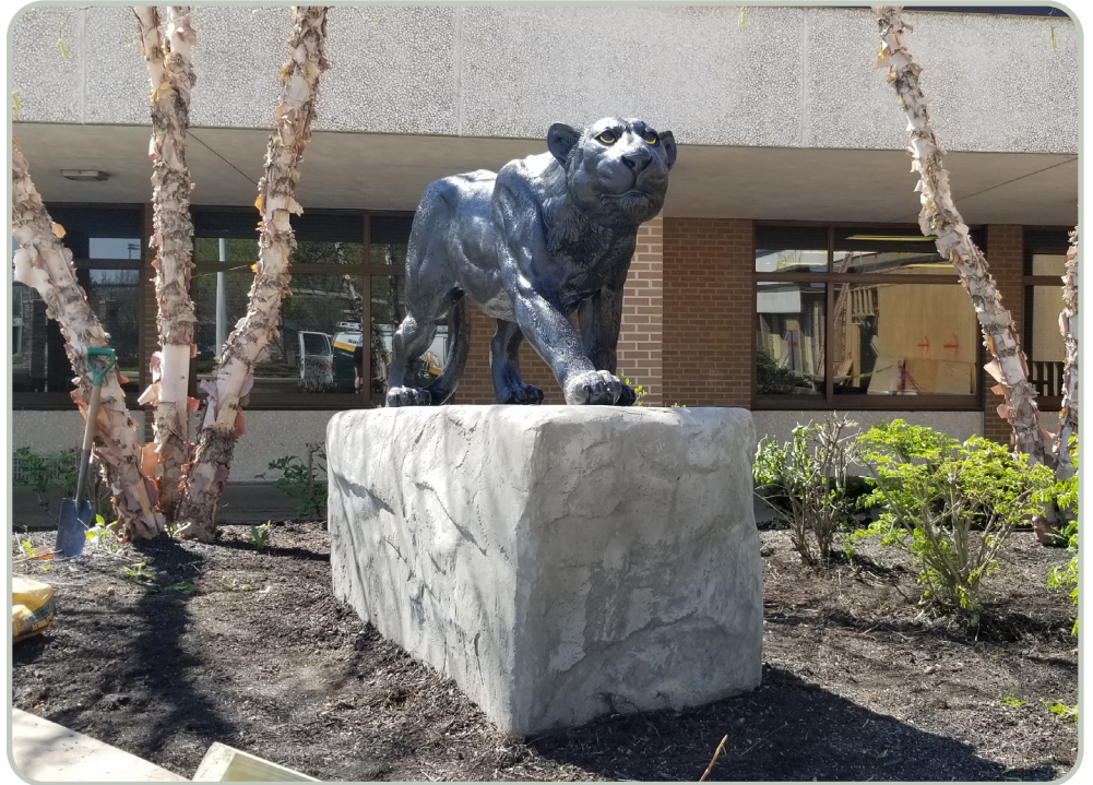
The Pioneer High School Art Department designed the panther statue and worked with Visual Impact Signs.

The entrance to Pioneer High School is in the process of getting a new look under the current Capital Improvement Project. Along with those upgrades, another fresh element is being added to welcome visitors.