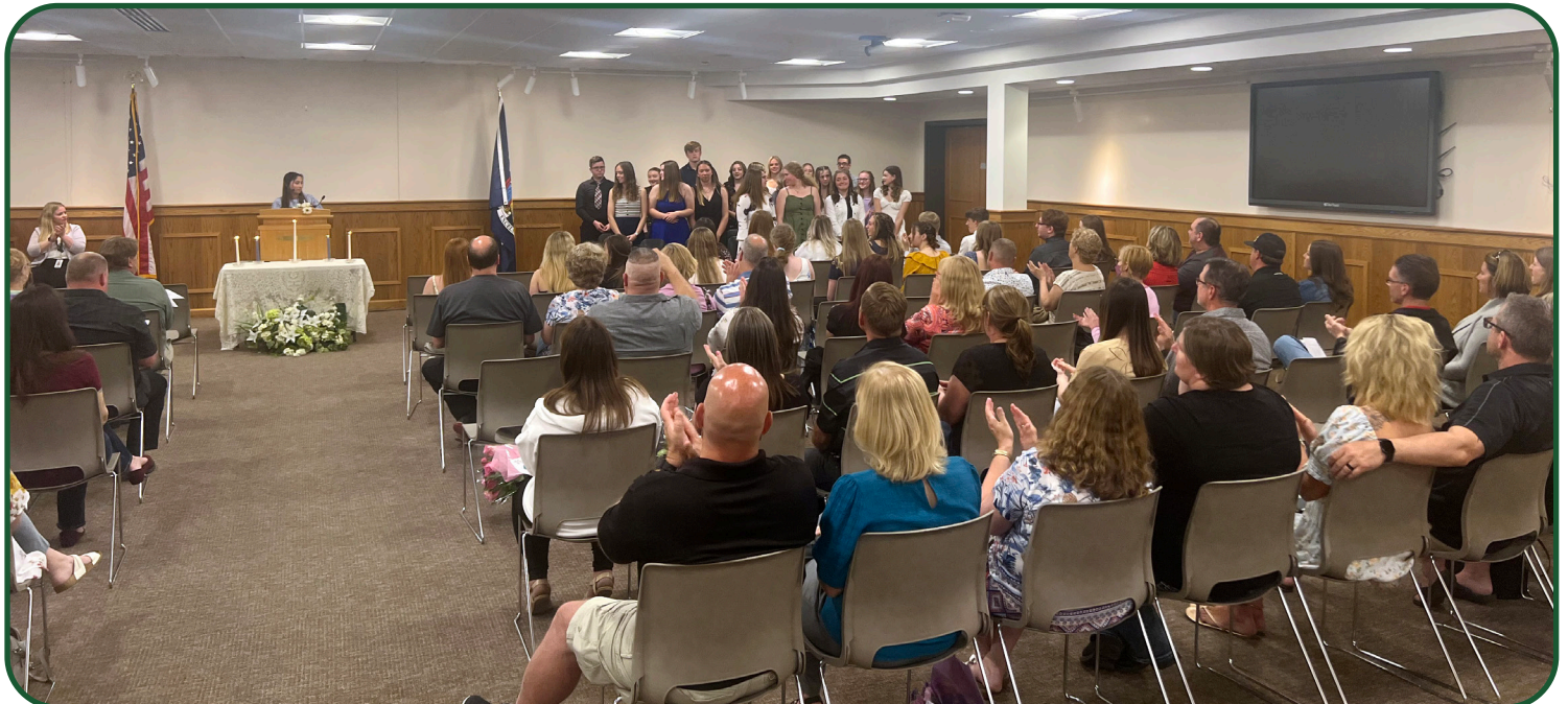
Newly minted members of the National Honor Society are applauded for their achievements.