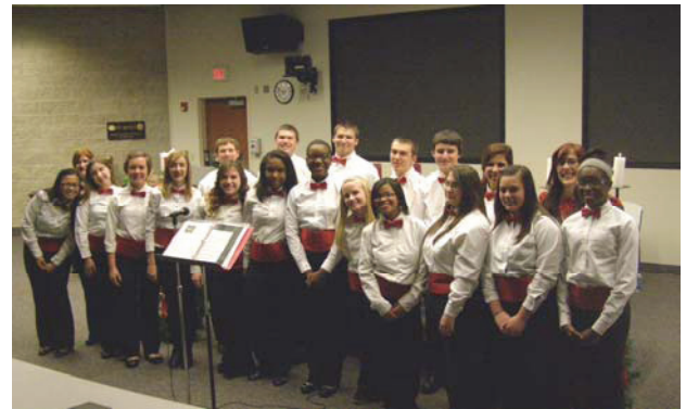
Christmas Choir Concert 2012