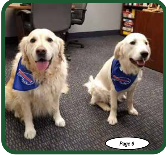
Pioneer Middle School therapy dogs Louie and Brinley show their Buffalo Bills spirit.