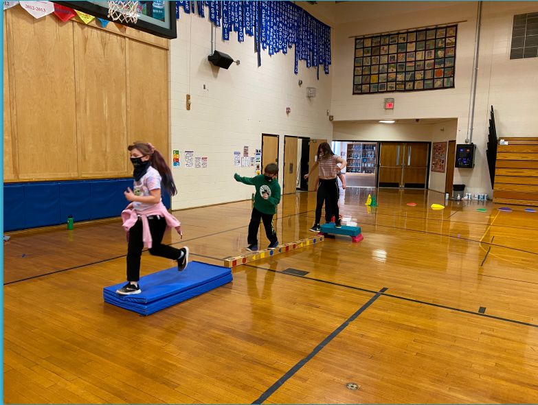
Fourth grade students testing the obstacle course they created in gym class.