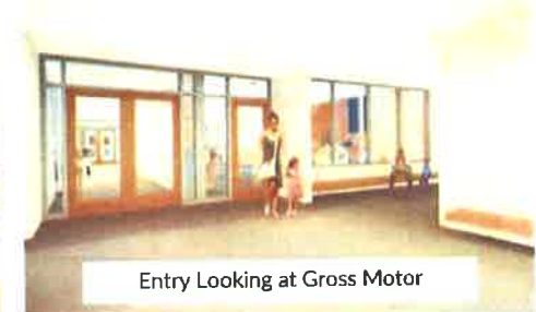
Entry Looking at Gross Motor