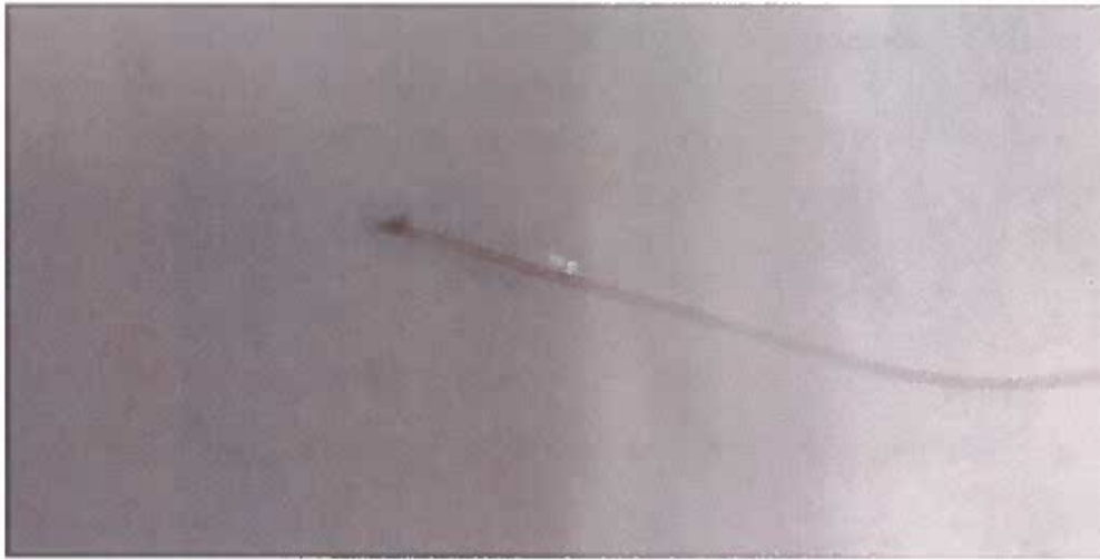
Photo 2- How to Spot Head Lice.