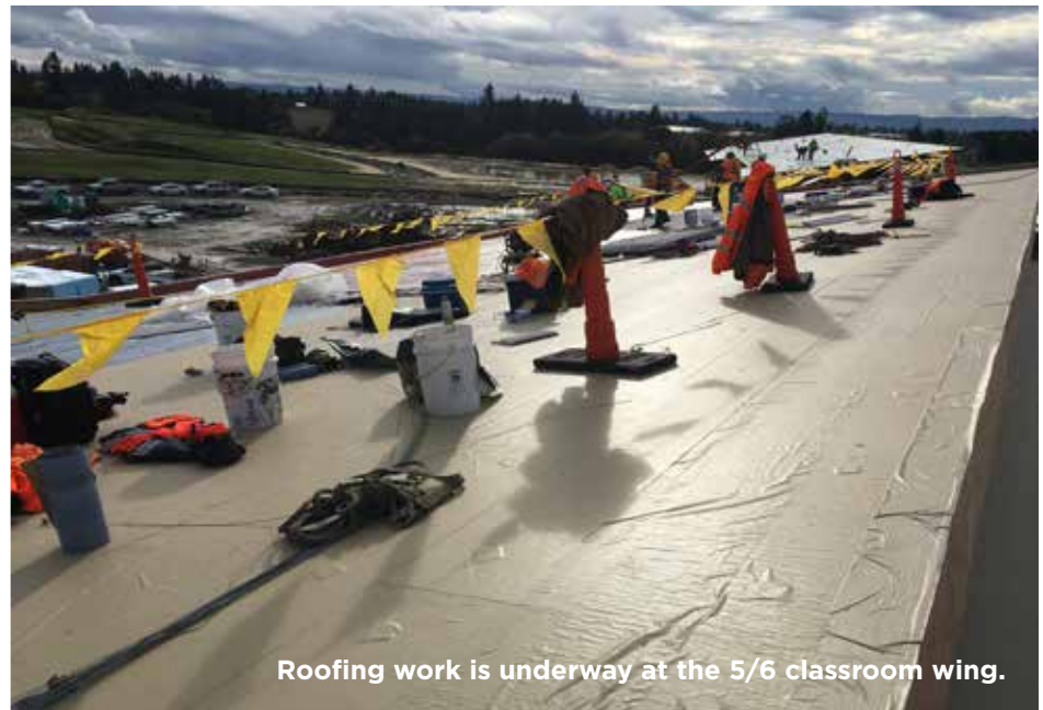
Roofing work is underway at the 5/6 classroom wing.