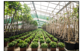
Nursery: Greenhouse, sod, etc.