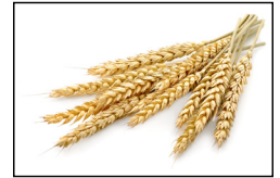
Crops: Wheat, corn, soybeans, etc.