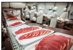
Processing: Meat, fruit, trees, vegetables, etc.