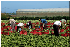
Harvest: Vegetables, Fruit, etc.