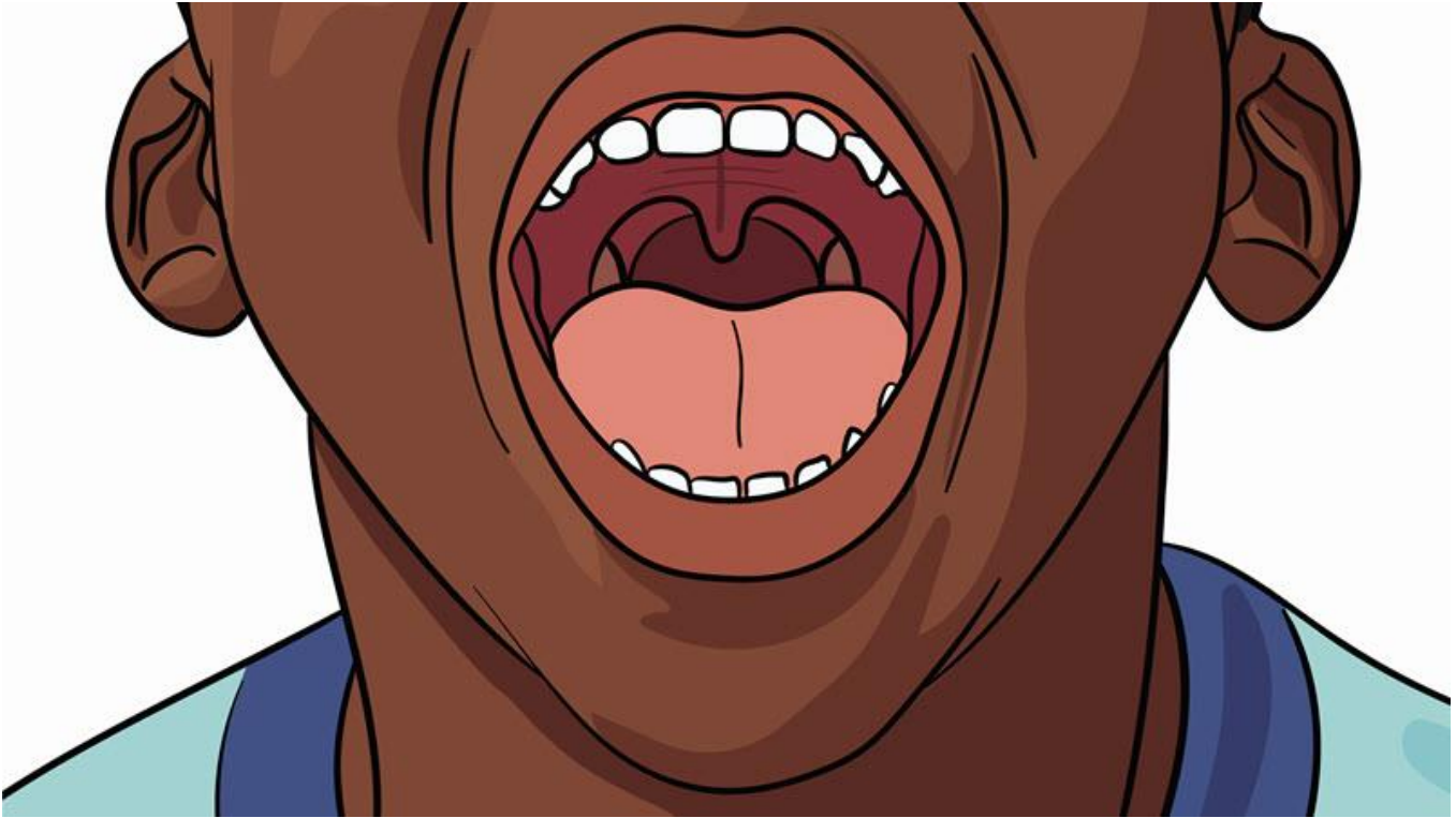
A healthy throat