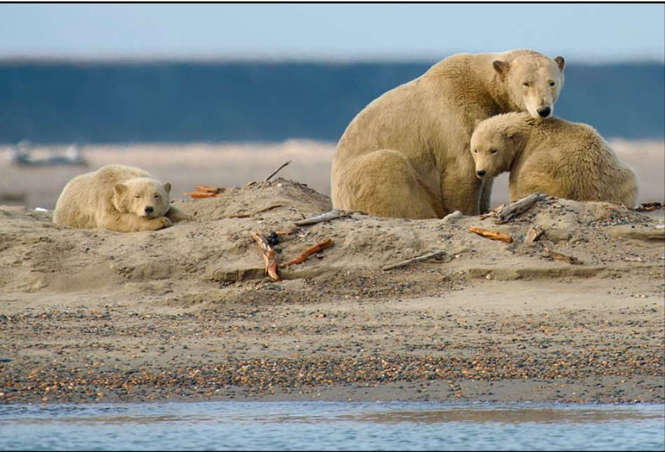
Polar bear and her two cubs in the Arctic National Wildlife Refuge suffering from a lack of ice and habitat destruction. The ice that these and other polar bears rely on has been melting due to ongoing carbon dioxide emissions, causing global warming, and making the species vulnerable.