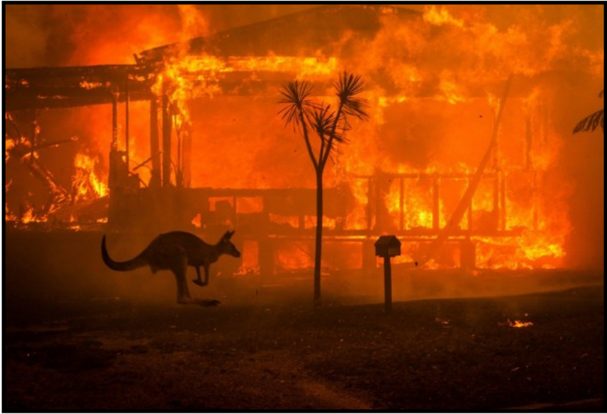
Although firefighters from all over the world were trying endlessly to put out the Australian fires, they continued to burn down everything in their way. Over 45 million acres were destroyed, 5,900 building were burnt down, and 2,779 homes were burnt up

Jun. 6 - The estimated amount of 500,000 people joined to protest for the black lives matter (BLM) movement in 550