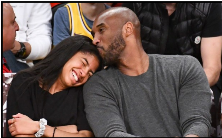
Kobe Bryant was a loving father to not only Gianna, but also his three other children. Kobe and Gianna, also known as Gigi, died too young; Kobe was 41 and Gigi was 13.

COUNTDOWN TO BREAK: 14 Days Next break is January 18—MLK Jr Day