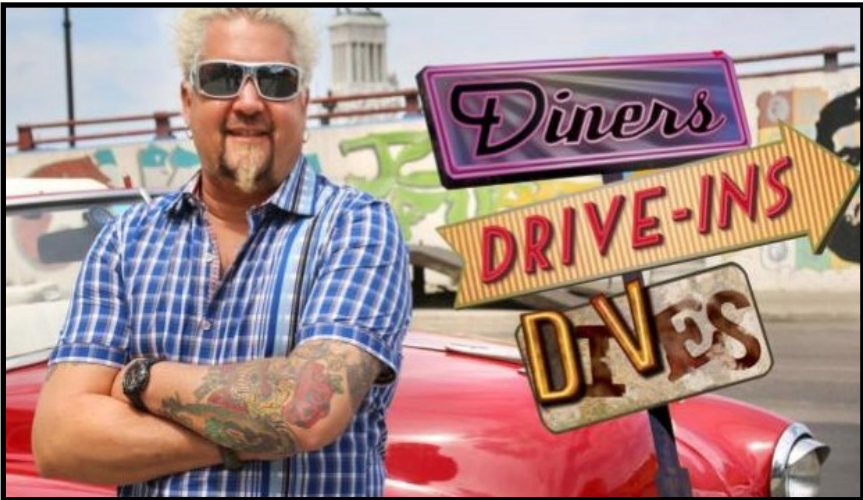
Guy Fieri posed next to his signature red car with the title of his show: Diners, Drive-Ins and Dives. The show has been a staple on the Food Network since 2007.

A: “It was truly shocking, I didn’t believe her. I thought it was a scam, so I went through the process of getting information by contacting Food Network and then getting reconnected with the producer. Once I found out that it was true, I’ve been in shock ever since.”