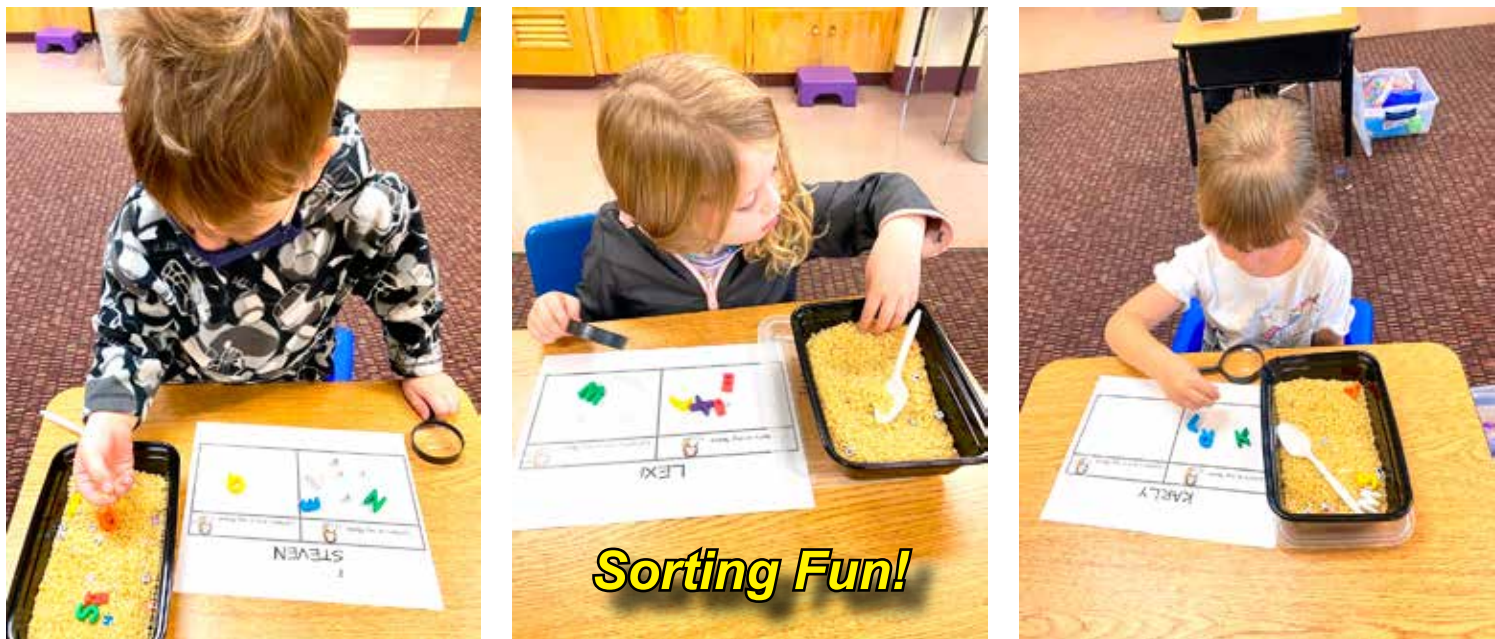
UNIVERSAL PREKINDERGARTEN STUDENTS in Mrs. Dryndas' class at Delevan Elementary School are shown completing a name sorting project using alphabet soup.