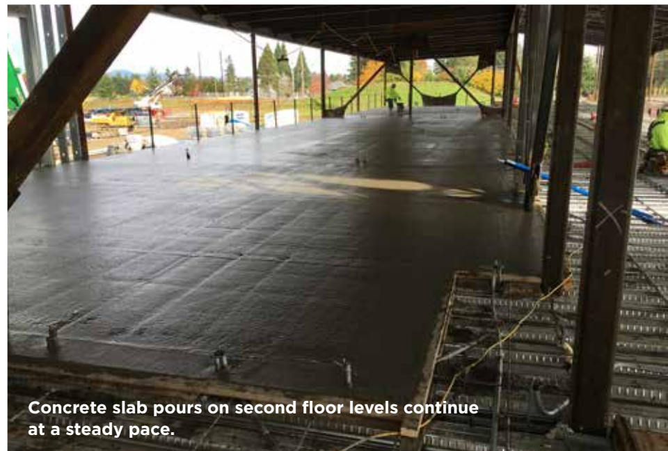
Concrete slab pours on second floor levels continue at a steady pace.