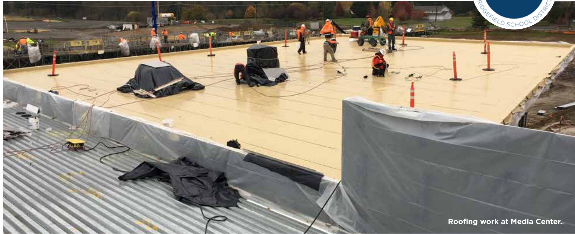
Roofing work at Media Center.