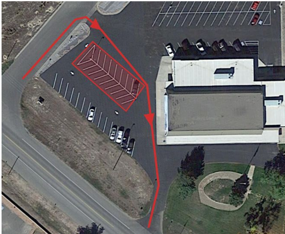
Parking at the EEC during drop-off/pick-up