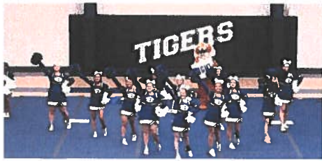
CHS Cheer competed in Game Day Regional Cheer in Stroud Nov 5th. They qualified for State on Nov 11th.