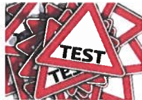
ACT Testing was held Oct. 19th