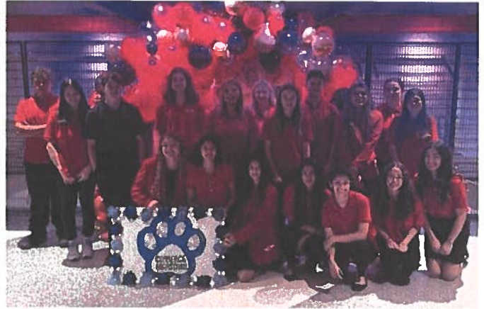
FCCLA attended their District Leadership Meeting Oct. 24th.