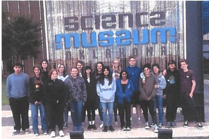
The CHS Science Club took a field trip to the OK City Science Museum Oct. 8th.