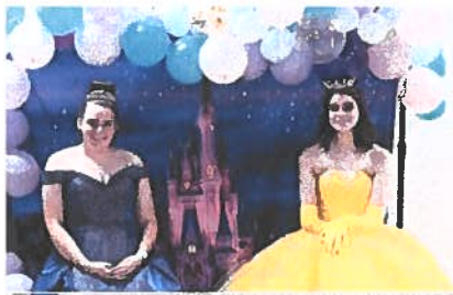
The Jr Class After Prom held a breakfast with Princesses & Superheroes Oct. 29th.