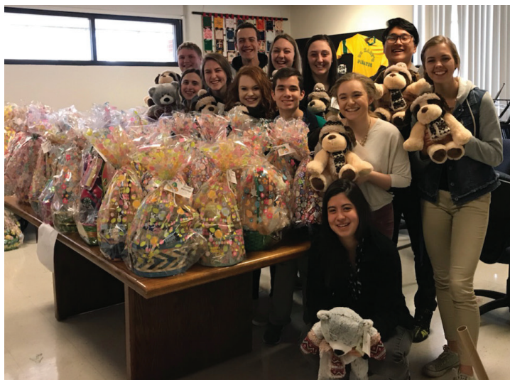
Community service is a big part of life at St. Mary's. In the spring, several St. Mary's clubs came together to support an Easter basket project. The Campus Ministers filled more than 100 baskets that were delivered to area children.