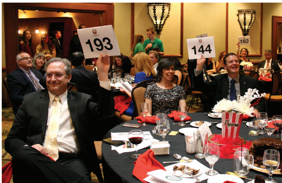
Each year the live auction at the Gala provides for fun competition as supporters raise funds for SMHS.

The 2018 Gala grossed more than $130,000 for St. Mary's. This year's Gift from the Heart special appeal raised a little more than $50,000 in support