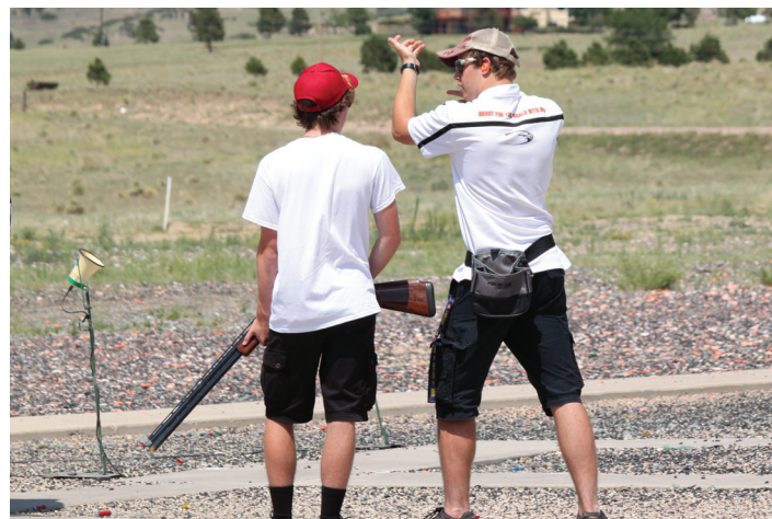
Gala auction winners joined members of the St. Mary's competitive shooting team in July for a demonstration.