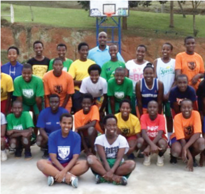
Crossover for Change plans to host basketball camps for girls from two Ugandan schools—Maryhill High School in Mbarre and Immaculate Heart Girls School in Nyakibale—in June 2021. The goal is to promote a sense of empowerment among the girls using basketball as a tool.

players, but never expected to be able to give back to someone half a world away.