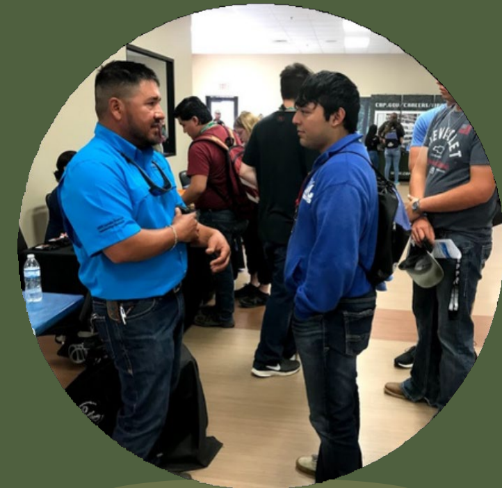
College and Career Readiness Supports