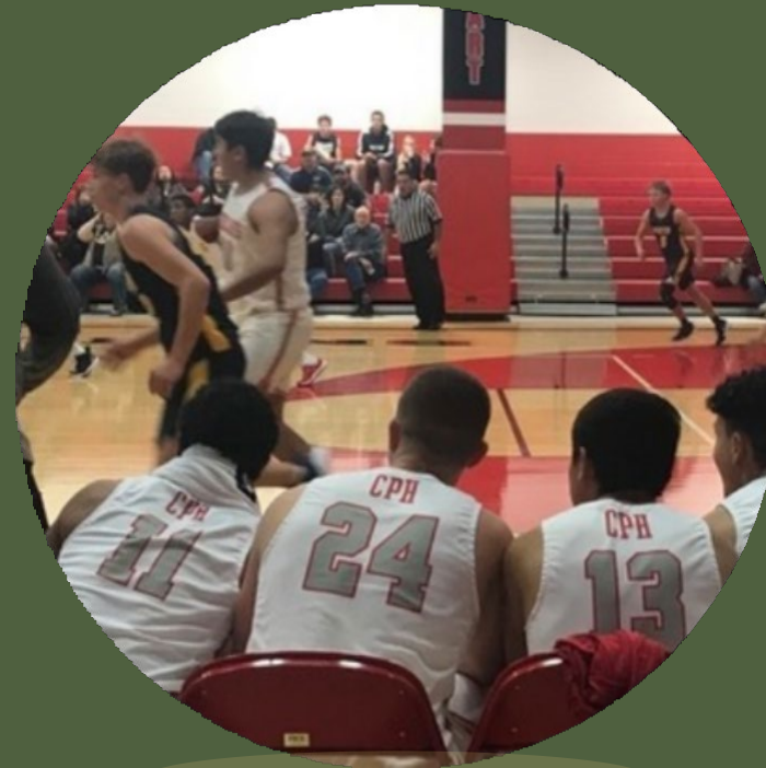
Extracurricular clubs, athletics, UIL