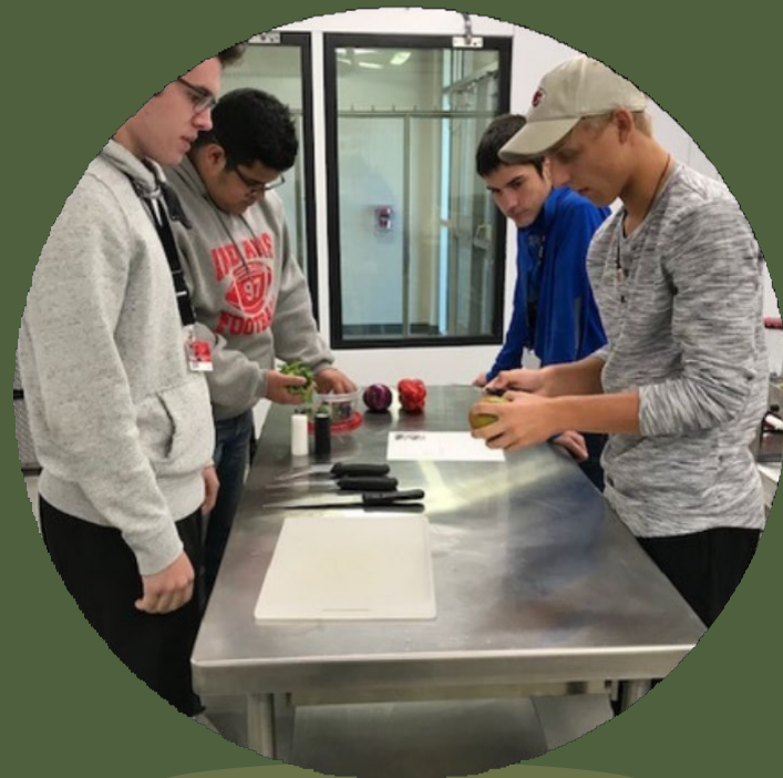
Classes with Hands on Activities