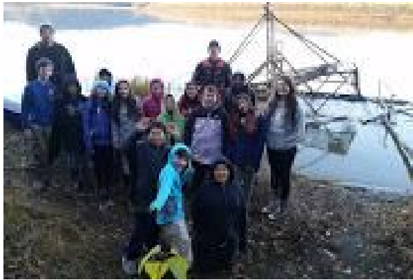
Class in front of the Fish Wheel

The questions we asked him were, what type of wood was it made out of? What kind of fish are caught? Approximately how many fish do we get a day? The Fish Wheel is made out of cottonwood. The kind of fish that it caught was Cisco, Broad and Humpback Whitefish. Also Bering Cisco, Grayling and Dogfish. It can hold up to 50-100 fish a day.